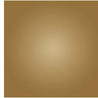
Titanium - TIM